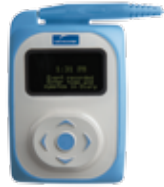
IQholter™, EX, EP