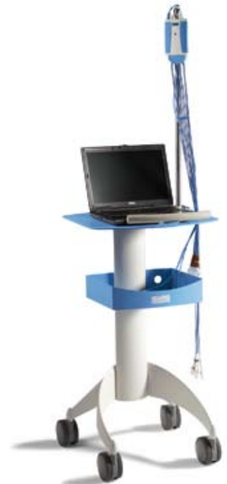
IQecg™ on IQcart™

Computer analysis and interpretation is not a substitute for physician interpretation and, therefore, should be examined with respect to the patient's overall clinical condition.