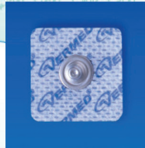
A10043, shown actual size