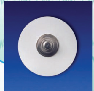
A10050-60, shown actual size

All NeuroPlus electrodes meet or exceed AAMI specifications and are also suitable for use with EKG monitors.